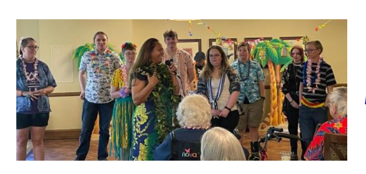
Polynesian Luau at ESMRC