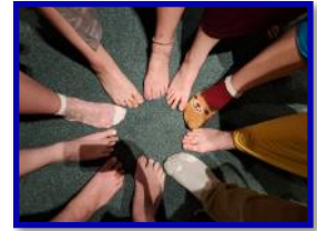
NO shoes meeting!