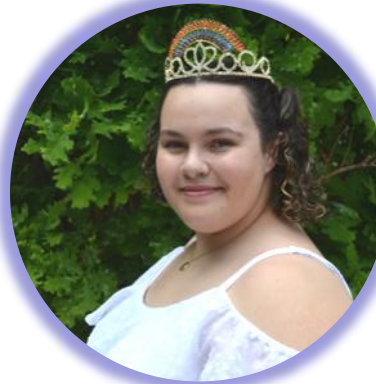
"Plant the S.T.E.M. of Innovation"

As we began school year and continue through finals, etc, I know stress can be high. Whether you started a new school, are worried about a class, or you're nervous about who is in your class, I want each of you to know that all of your sisters are probably having similar worries. I want everyone to know that Rainbow will always be a constant for you girls to turn to, and every one of us is always here to help