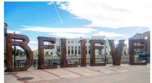
Did you know Reno has amazing art installations all around the city? This one sits right next to the Truckee river!