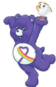
Rainbow Heart Bear